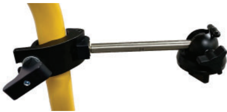
C-MCM "Claw" Clamp Mount