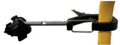
SC-MCM Safety Clamp Mount